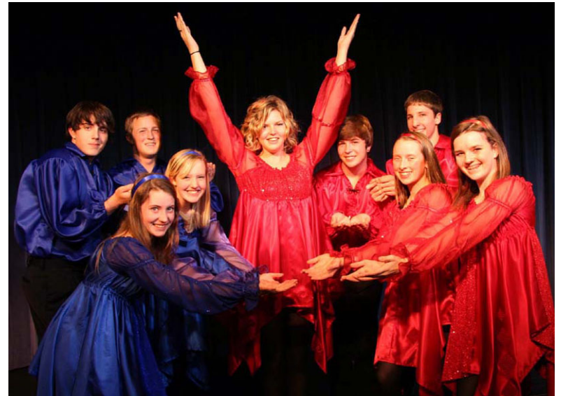
Those who enjoyed Barnum will have a great time at "Broadway Bound: A Musical Revue"!

record amount of funding for scholarships and expenses. For example, charter bus costs will be doubled this year because the group will now require two charter buses to transport everyone.