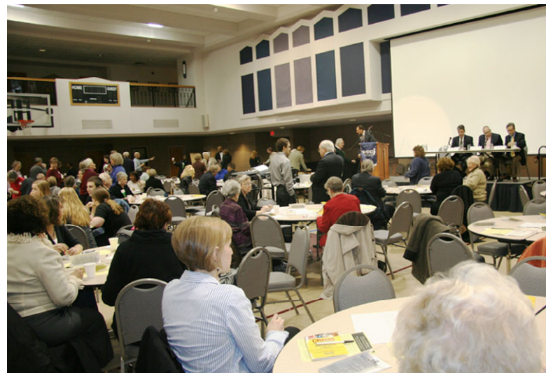
Above, the Tulsa interfaith heard three excellent presenters in the first session in the annual OCCJ Trialogue last Sunday. This community will also work together, building two houses side by side through Habitat for Humanity beginning in March.

One home will be built for a young woman who works full time and attends classes at TCC at night. She has lost her mother, a baby and her sister in the past two years and currently supports a teenage niece as well.