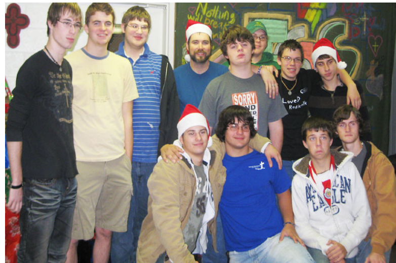
These young men are learning to care for themselves through Circle of Care's Independent Living Program.

The Oklahoma United Methodist Circle of Care has been ministering to "at-promise" children, youth and families since 1917 through residential and foster care. Circle of Care ministries include: Child SHARE Foster Care, Pearl's Home Transitional Housing for Homeless Women with Children at Frances E. Willard Ministry Center in Tulsa, Holsinger Home for Children in Enid, United Methodist Boy's Ranch in Gore, United Methodist Children's Home in Tahlequah, and Independent Living Programs (High School, High Education and Transitional Services)