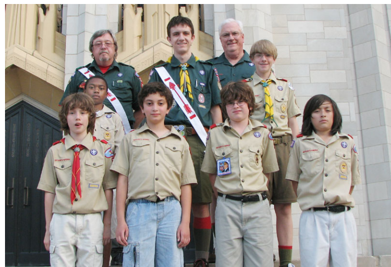
Above, members of Boston Avenue's Troop 20 served as greeters when our church hosted the Oklahoma United Methodist Church's Annual Conference in 2008.

Watch future issues of The Word for additional information.