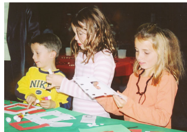
The women's retreat will be another useful tool for preparing for the holidays, just like the Advent Workshop, pictured above.

If you are a woman, help is just around the corner! This year's Women's Retreat will focus on those very questions.