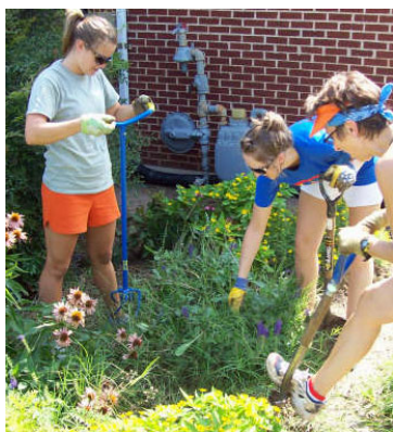
To feel good for a lifetime, help others in need.

Some projects will involve the morning only, while others will stretch into the afternoon. Projects for older children through adults will include