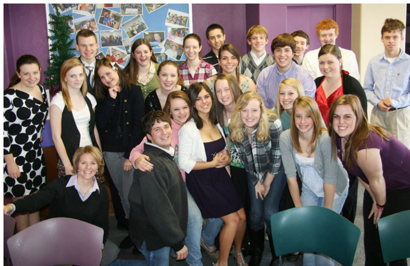
2009 Senior High Youth Volunteer-in-Mission Team